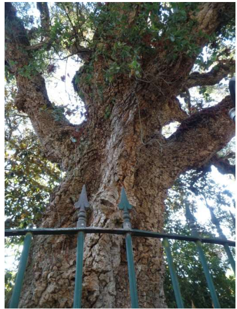
Quercus suber – Sobreira dos Fetos – D. R. 276 II Série 28/11/96